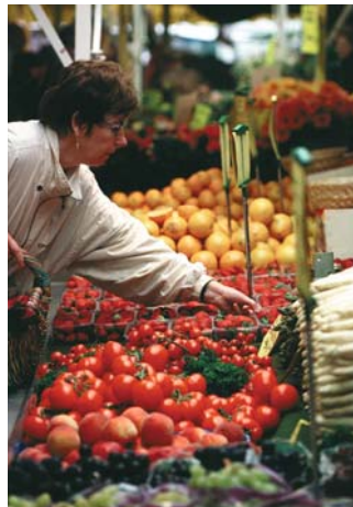
Market at the Cathedral

On Fridays, the cathedral square hosts a "palaver market", on which mainly highly nutritious products and produce from ecological cultivation can be bought. Additional weekly markets – slightly smaller than the one in the inner city – are held in the suburbs: Schloß Neuhaus on Thursdays and in Elsen on Fridays.