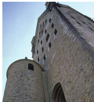
The mighty cathedral tower

The Square in front of the Town Hall leads directly onto the Marienplatz where you will find the Tourist Information Centre and next to that the (5) Heisingische Haus (Heising House) . Continue past the Mariensäule (Column of the Virgin Mary) built in 1861 and after crossing the road 'Am Abdinghof' you reach the (6) Abdinghofkirche (Abdinghof Church) with its twin Romanesque towers.