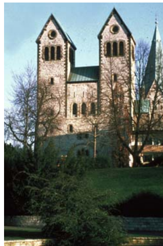
The Abdinghof Church

Guided tour for groups of adults and youths over 16 years. (No guided tours on Mondays) Price: as for "A short walk" (plus 1 € admission fee per person)