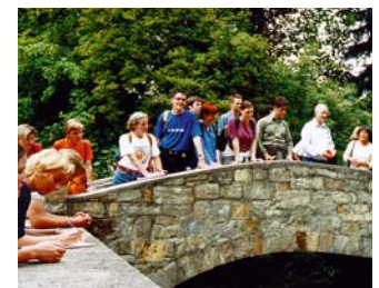
Guided tour in the Geissel Gardens

Every Saturday, 11 am - 12:30: "Short walk through the town". No appointments required. Start at the Tourist Information Centre. For further schedules and reser- vations for guided tours: Tourist Information Centre. A list of all guided tours offered can be found on pages 10 and 11.