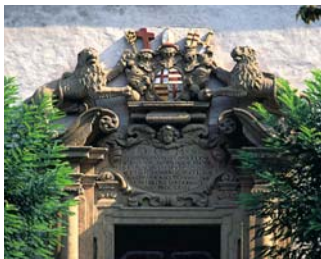
Portal of the Busdorf Church

Guided tour for groups of adults and youths over 16 years. (No guided tours on Sundays or Public Holidays)