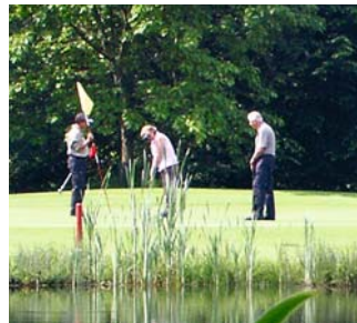
Golf Club Paderborner Land