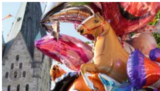
Libori in the city

For more detailed information on events contact the Tourist Information Centre, Marienplatz 2a, 33098 Paderborn, or by calling (0) 52 51/88-29 80. A list of events can be found on the Internet under www.paderborn.de/veranstaltungen (in German).