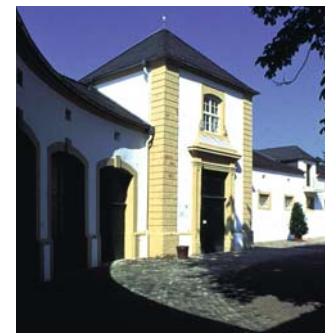
Museum in the Marstall

For telephone calls to Germany please dial + 49, then the local dialling code without the "0". For calls within Germany use the local dialling code with the "0".