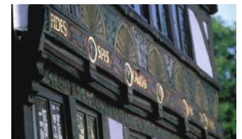
Adam and Eve House

The numbers in blue refer to the inner city plan found at the rear of this brochure. You will find the numbers also on the boards of the information and guide system for pedestrians in the town centre.