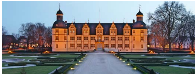
Schloß Neuhaus with its baroque garden

The nearby recreation area Fischteiche (Fish Ponds) is – together with the Pader Lake – an ideal place to go for a walk, to jog, play mini golf or row. Cafés and restaurants invite you in, and children can enjoy themselves on the playgrounds. The "pader kletter park" (rope climbing) in natural surroundings