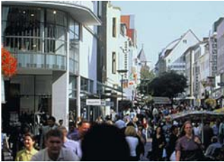
Paderborn's Pedestrian zone

Paderborn's shopping area stretches from the main railway station to 'Giersstraße'. Large parts are pedestrian zone (refer to the inner city map on the back cover).