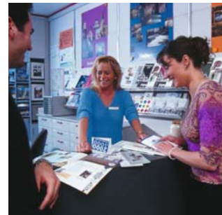
Tourist Information Centre