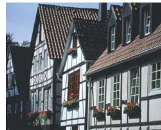
'Auf den Dielen'

Walk past the Abdinghof Church and turn left into 'Michaelstraße'. Two baroque buildings are situated here on the right hand side. In the Geissel Gardens, is the former (8) Domdechanei (Cathedral Deanery) and on the left lies the (9) Michaelskirche (St. Michael's Church) . On the far side of the (10) Geißelschen Garten (Geissel Gardens) , a conservation area encircled by two further arms of the Pader, is the small street 'Auf den Dielen'. The carefully restored timber framed houses are well worth seeing.