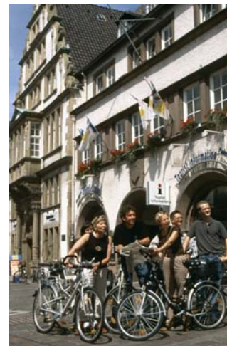
The Tourist Information Centre

(approx. 12 km; bikes can be rented) Guided tour for groups of adults and youths over 16 years. Price: 180 min. 75 €, 5 € reduction for school/student groups